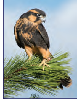
Sonora the Aplomado Falcon 2013