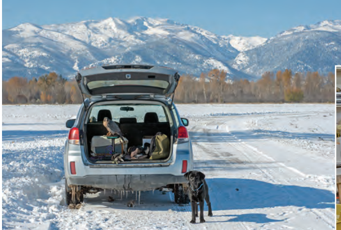
Sib caught a Coot in the Bitterroot last winter!