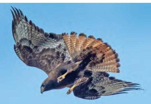
Dark-morph Red-tailed Hawk, here all year, warm brown colors of our resident Western subspecies. All three here are adults, notice the telltale dark eyes.