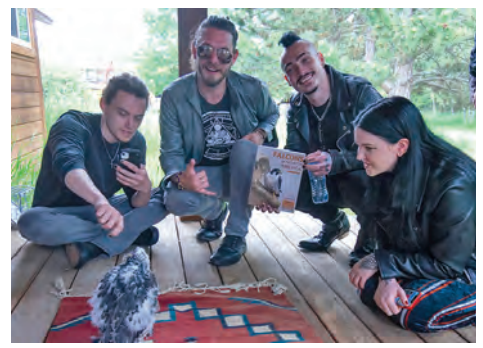
Queensryche Band Returns