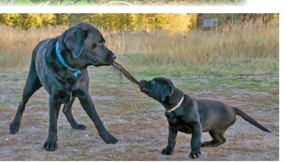
Arrowleaf Balsamroot patch near the house, and Nico and Mose play tug 'o war with a turkey feather.