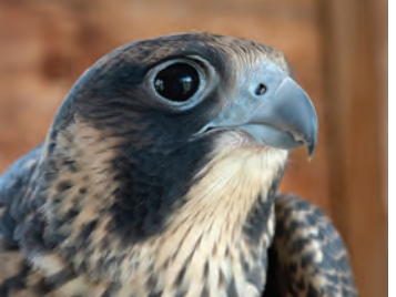
Mischa the Peregrine Falcon 2022