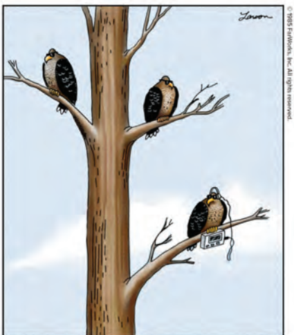
Birds of prey know they're cool.