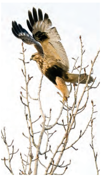
The big bird standing on a little limb or stick is a Rough-leg. David Sibley reports in the must-have Sibley Guide to Birds , "Rough-legged Hawks often perch on small twigs at the top of trees and shrubs." Watch for them all winter here, females and young birds with a dark belly band, all have a big black wrist patch in flight. The little tiny feet are feathered to the toes hence the "rough leg." And wouldn't you know, dark morphs to confuse us all.