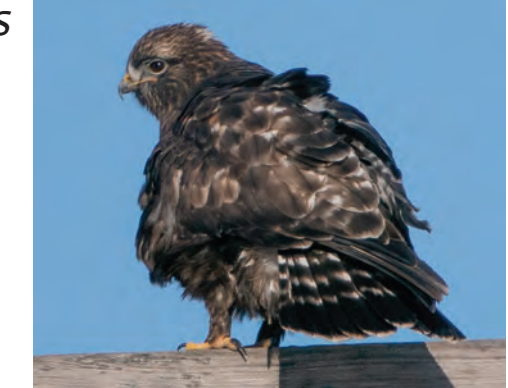
Dark morph Rough-leg with feathered legs, large head, small beak plus the striped tail of an adult male, another winter bird.