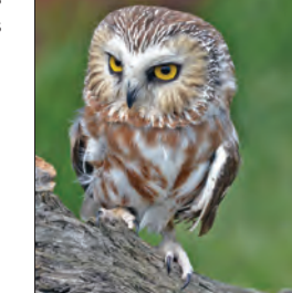
Owen the Northern Saw-whet Owl 2012