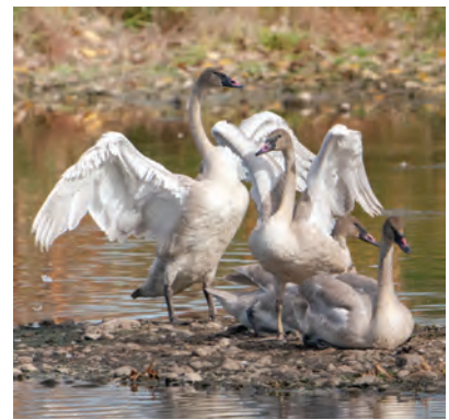
Bitterroot Porcupine & Trumpeter Swans California Quail- one of about 30 in our yard lately, plus Eurasian Collared Doves!