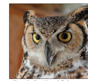
Simon the Great Horned Owl 2017