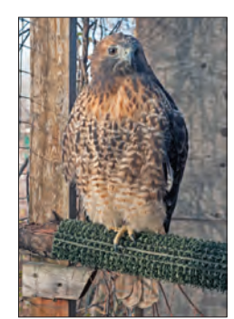
Simone the Red-tailed Hawk 2017