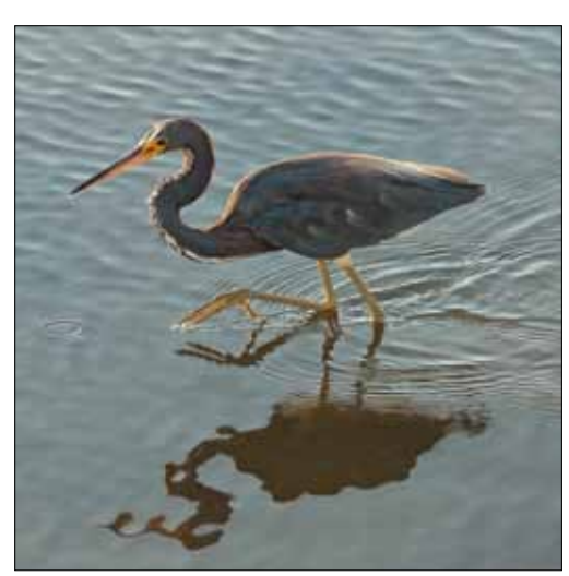
A Tricolored Heron, birds that seem to be always racing around the shallows like crazy.

Gulf. Male Peregrines, one-third smaller than the females, have been observed catching the numerous giant dragonflies, a hearty diet for their similar journey. The survey team sticks to designated "highways" to get from point to point on the Honda ATV's, and I actually started to recognize certain landmarks the second day, like "Green Well Head" in the distance. This must be what the surface of Mars looks like, minus the birds.