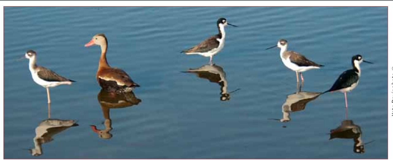
Black Stilts and an odd duck- a Black-bellied Whistling-Duck in Texas