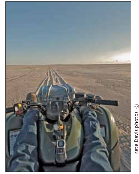
A view from the ATV on the beach at Padre. Camera is safely stowed in the Pelican case strapped to the front. There are Peregrines out there somewhere.

And Special Thanks to the Grounded Eagle Foundation