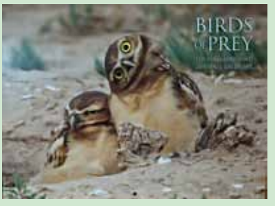
The new Peregrine Fund 2011 calendar is now out, and Rob and Nick cover half the months with their images of raptors, plus front and inside covers like this Burrowing Owl photo by Rob that is featured in our new book.