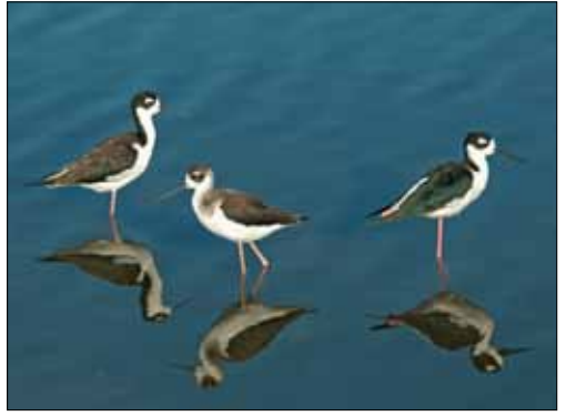
Black-necked Stilts, maybe migrating from Montana.