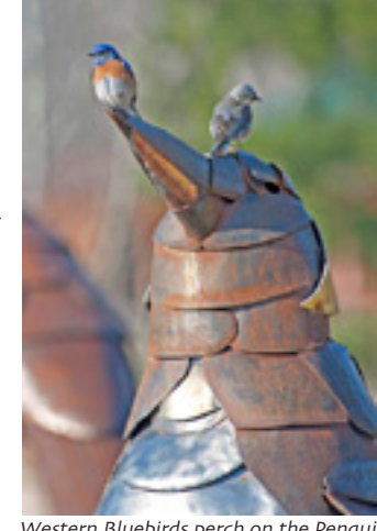
Western Bluebirds perch on the Penguin sculpture, announcing that spring is here.