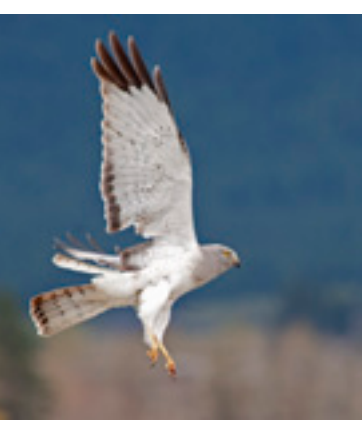
Note Cards, including a new batch, are available from us and at Rockin' Rudy's in Missoula. Over 70 different images and all proceeds to benefit our program!

Nick Dunlop Web Site: www.nickdunlop.com