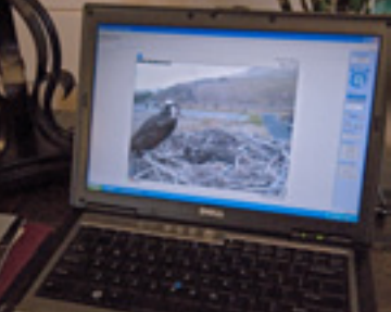
Live feed on a laptop in Riverside Health Care. Next year, a TV, maybe bigscreen!