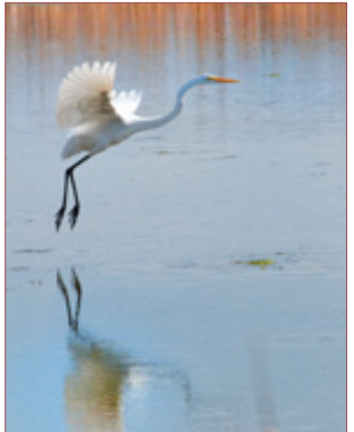
Great Egret at Lee Metcalf NWR