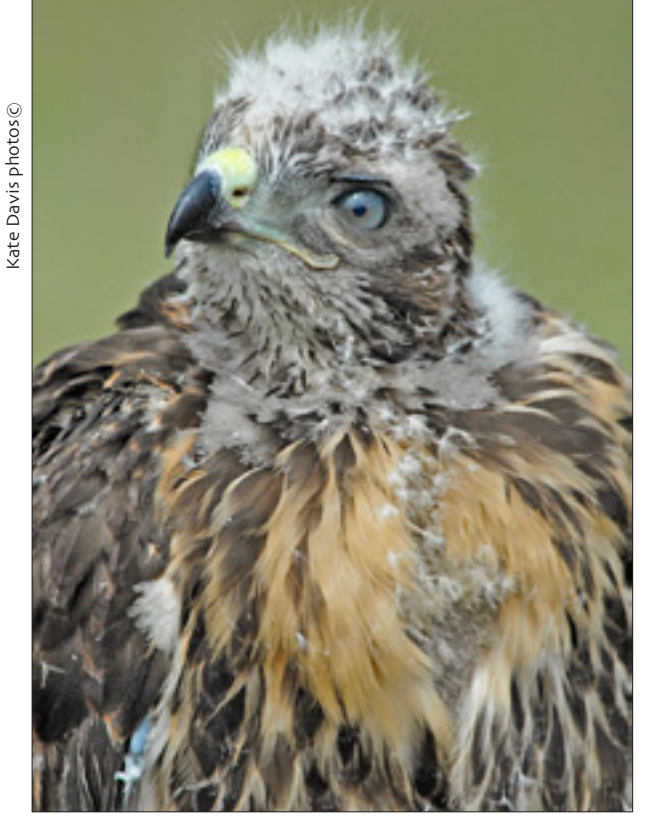
IAATE award for this photo of a young Red-tailed Hawk

The camp is suitable for kids age 9 to 13 (maybe a little older) and costs $100.