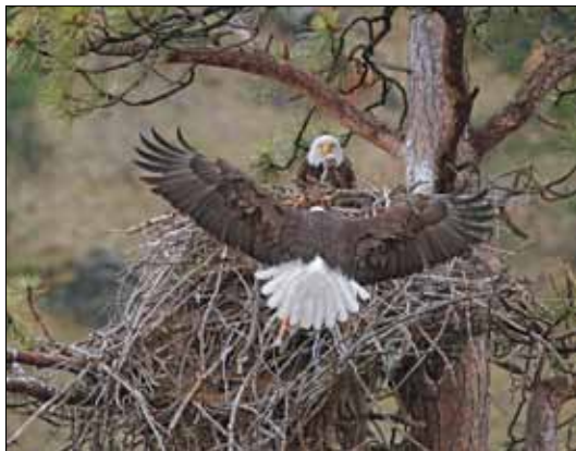
The Bald Eagle nest shot will be in the 2012 Peregrine Fund Calendar. Order one today from the P Fund! www.peregrinefund.org