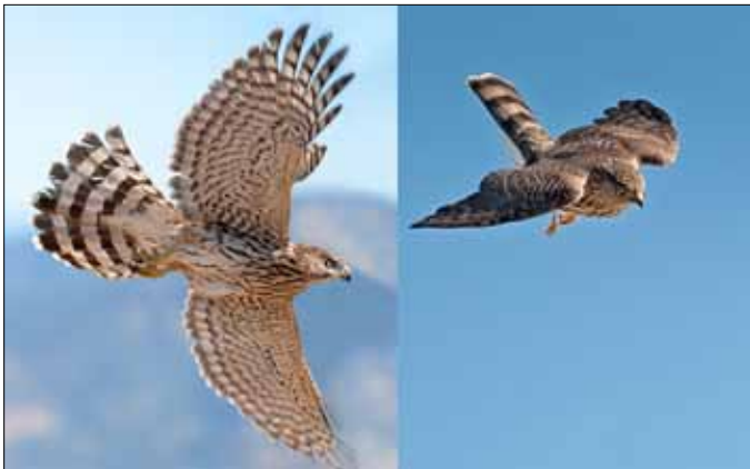
Immature Cooper's Hawk and Sharp-shin fly by the observation station.

The 8500 acre MPG Ranch across the river in the Sapphires has proven to be a raptor mecca. They promote conservation through restoration, research, education, and information sharing. The diligent hawkwatchers at MPG counted over 2155 migrants, the largest numbers being "kettles" of Red-tailed Hawks, 776 in all and nearly 400 Sharp-shinned Hawks. They even saw 6 Broad-winged Hawks, plus favorites, 84 Golden Eagles. Raptor View Research Institute lent a hand, and trapped and banded a number of the birds of prey passing by. Amazingly, over 500 Northern Saw-whet Owls were trapped and banded by the night time crew, telemetry attached to several and tracked. They are very excited for 2012 and the future!