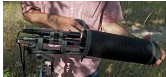
Mr. 3-D microphone