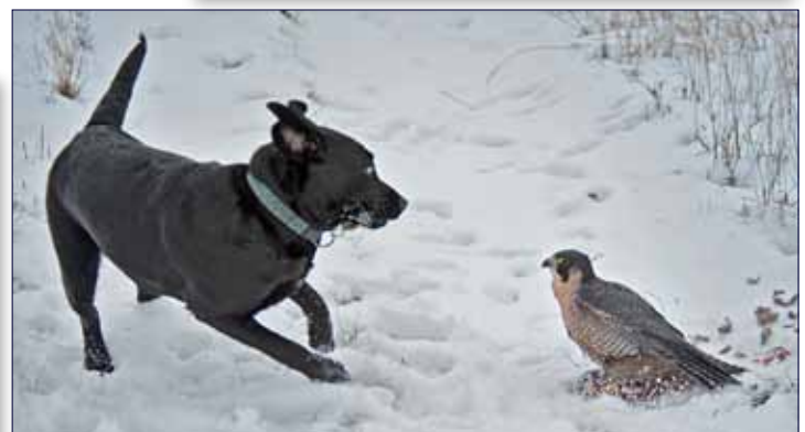
Mookie learns a valuable lesson about trying to take a falcon's food away