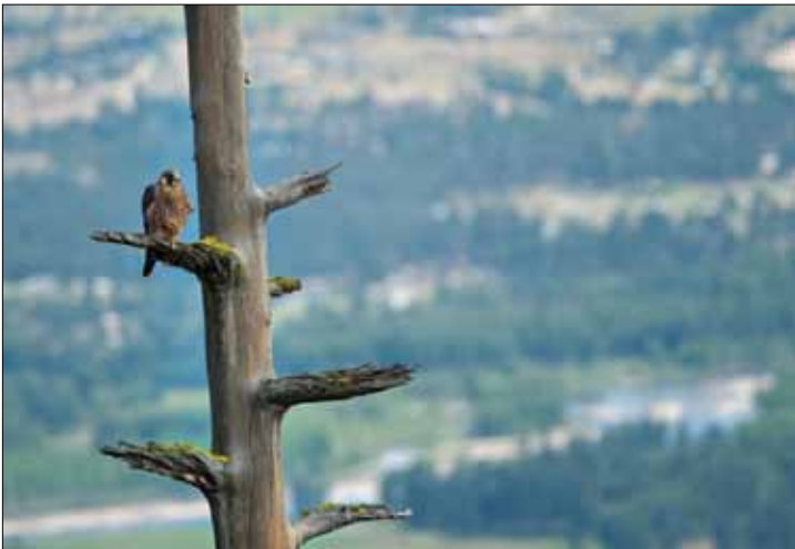
A One Horse Creek fledgling across from the Raptor Ranch.