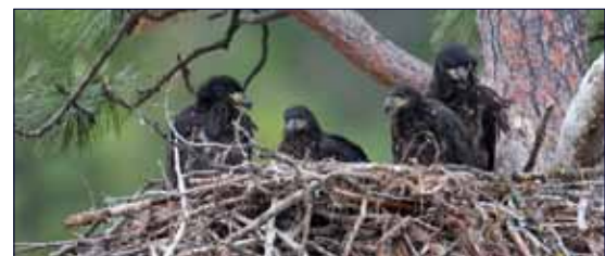
Left: One Eastern Fox Squirrel, coming right up. Also on the menu, Columbian Ground Squirrels, pigeons, and starlings. Above: A family of Eastern Fox Squirrels actually shared the nest, and the young of each would often give each other curious looks. Living on the edge, those guys.