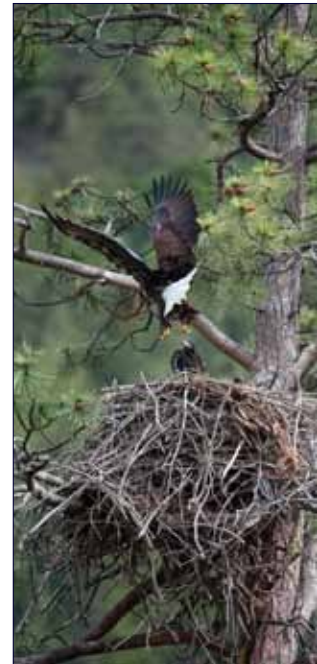
Left: Another delivery of what we can only guess is part of a Canada Goose gosling, white down flying when it's plucked. They always returned from the direction of a golf course. Above: Young are treated to a duck head.