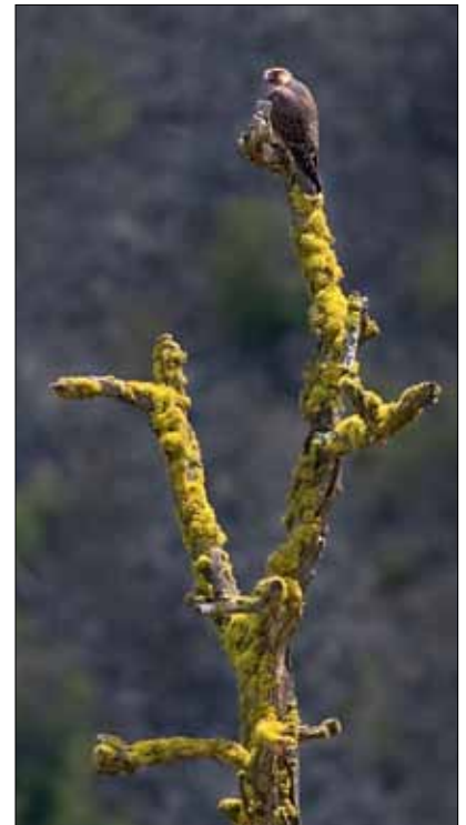
Peregrine Falcons were gone from the state, victims of the adverse effects of the pesticide DDT. Over 600 captive bred birds were hacked out, or released at suitable sites, the first pair breeding at Red Rock Lakes National Wildlife Refuge in 1984. Over 90 nests grace our cliffs (and one gravel pit) today.