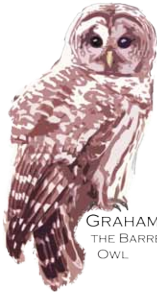
GRAHAM THE BARRED OWL