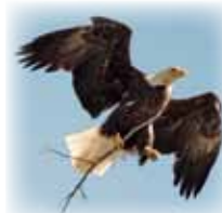
Right: The male was smaller and had more of a wing molt all summer, so we could tell them apart.