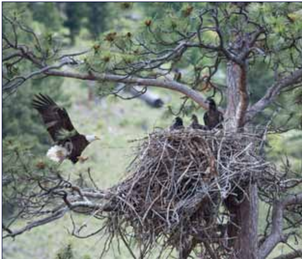
I rented a 500 mm f/4 from Borrowlenses.com for a week, and it rained for three days, but got some good images.