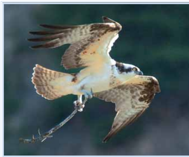
Osprey and Black-chinned Hummingbird

Both parents were superb providers, patient and thorough at feeding time, and nearly always lingering somewhere in the background with a keen eye on the enormous nest in the Ponderosa Pine. Their offspring almost seemed polite, allowing siblings to feed, waiting their turn, rarely scrapping as young birds. This in itself would make for interesting observations, but what sets this nest apart is that it fledged four young! Only a handful of nests have pulled this off, a remarkable feat for a raptor that is often the used as an example for fratricide; larger young kill their smaller nest mates. Four young in a Bald Eagle nest is very rare and it seems to be a fairly recent phenomenon, observed across the country with a few previous occurrences in Montana.